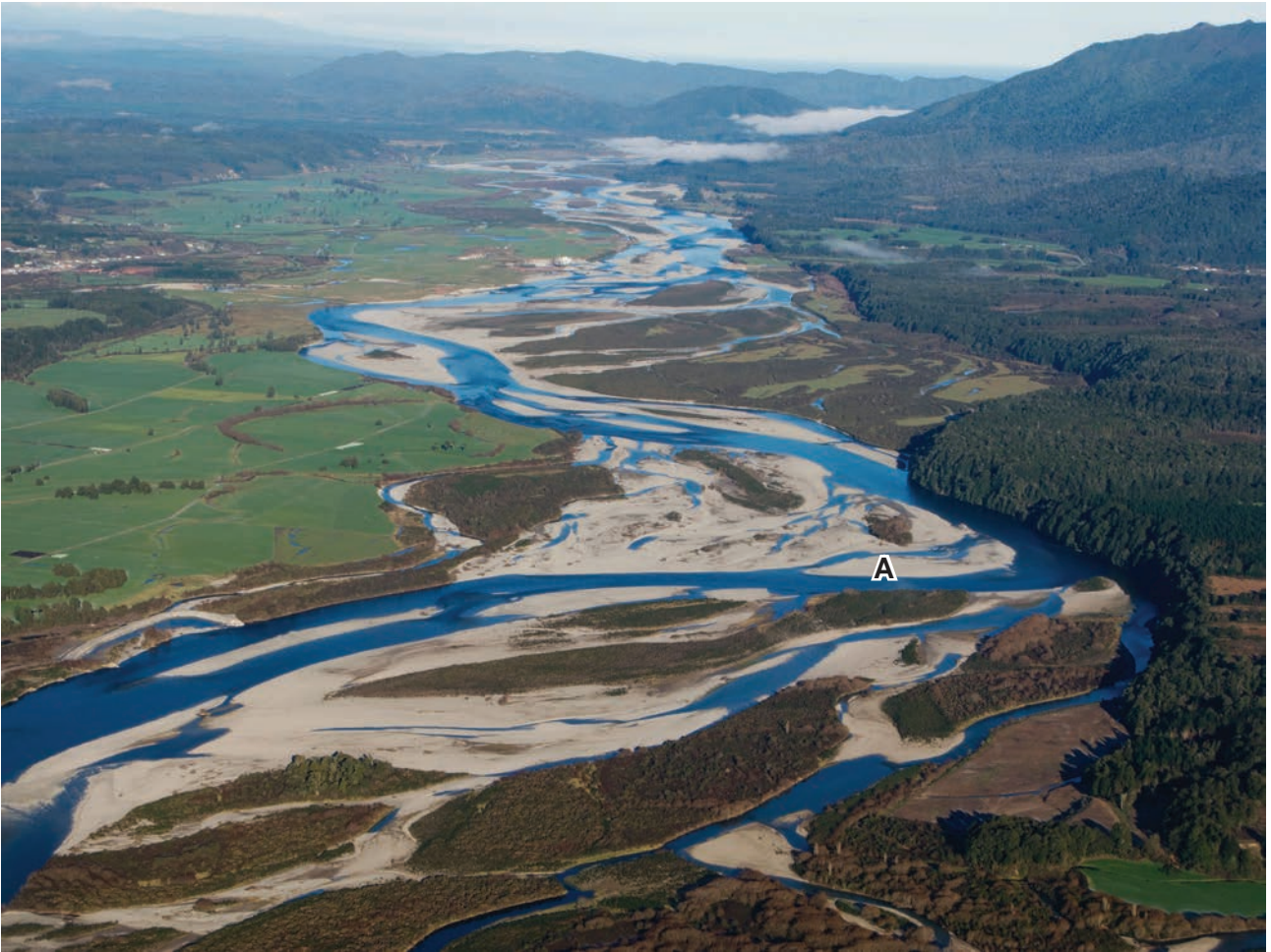
A braided river channel in South Island, New Zealand